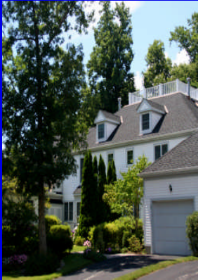
One of our lovely Brook Hills Condos

Wishing one and all a very Happy Thanksgiving.